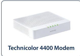
Technicolor 4400 Modem